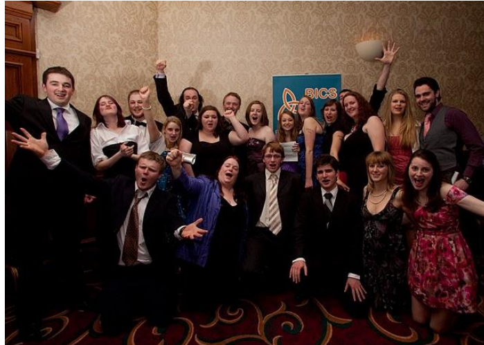
NUI Galway celebrates winning 4 out of a possible 9 awards at the BICS National Society Awards '09.